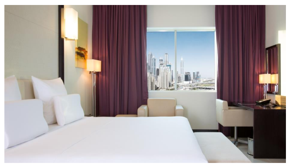
Superior Room King Bed