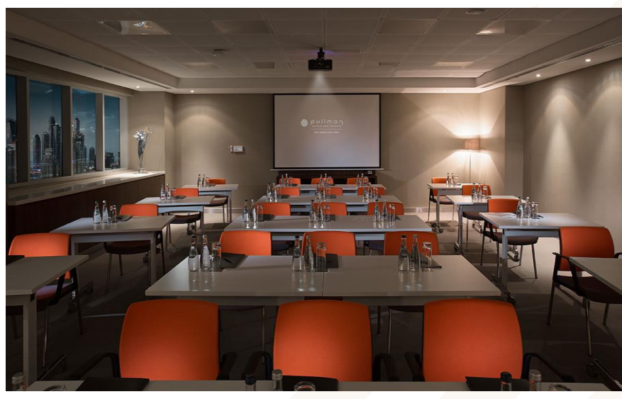
Ghantoot 1 & 2