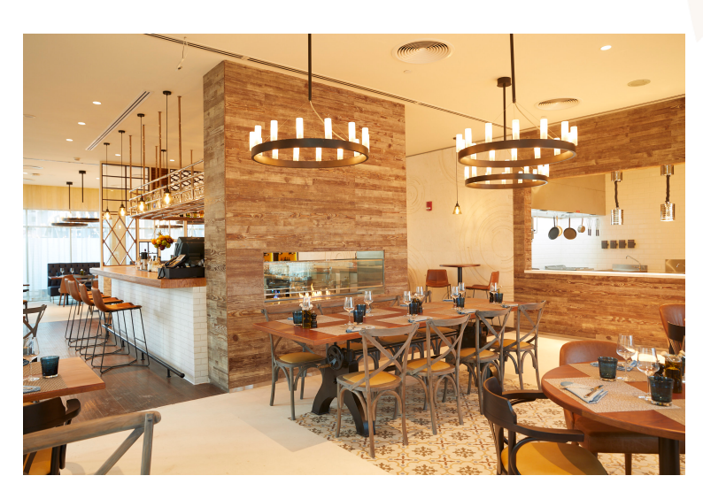
Manzoni Italian Restaurant