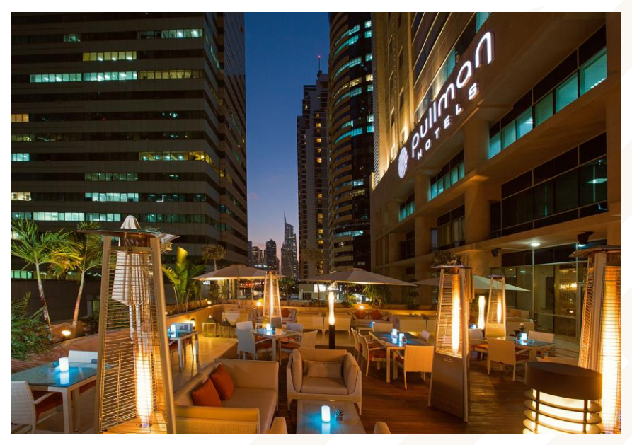
La Vue (Terrace)