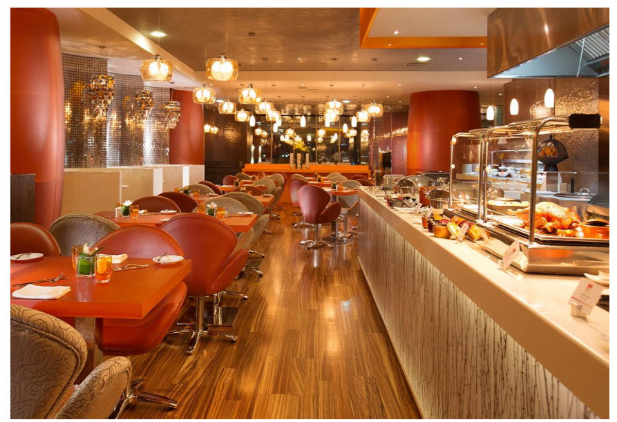
Seasons – All day dining restaurant