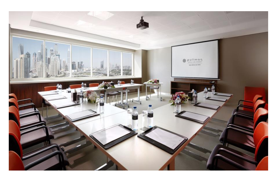
Al Ain or Liwa