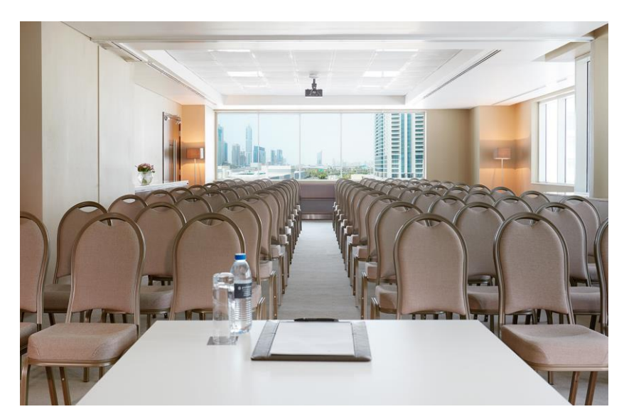
Jumeirah 1 & 2