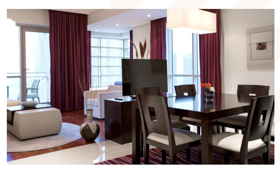
Apartments – one , two & three bedrooms