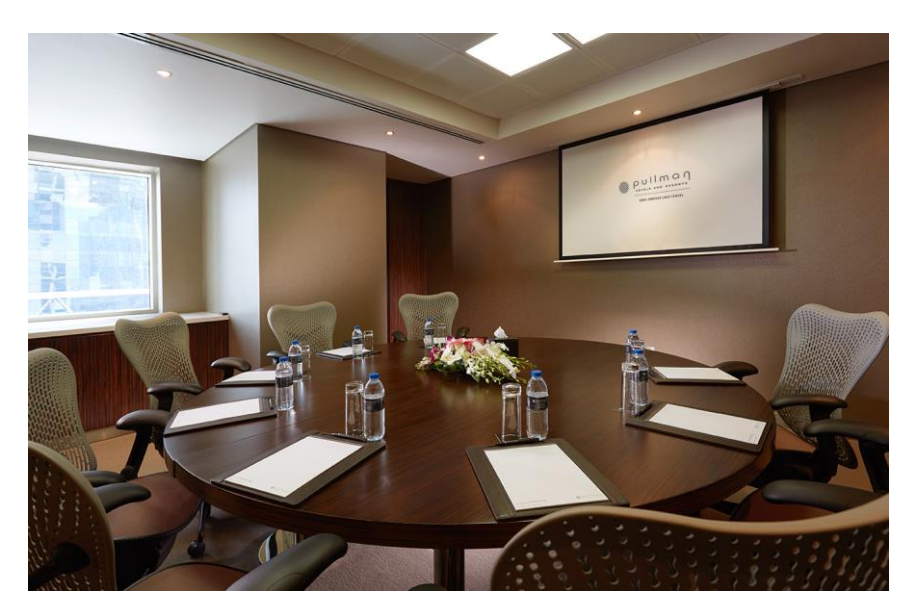
Deira or Oryx